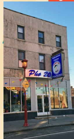
Pho 20 234 N. 10th St. Vietnamese cuisine