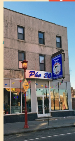
Pho 20 北10th街234號 越南美食