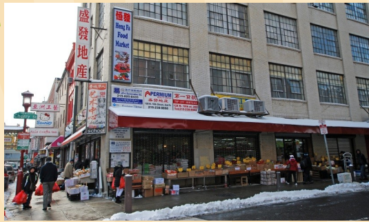
Heng Fa Food Market Corner of 10th & Cherry St. Chinese supermarket