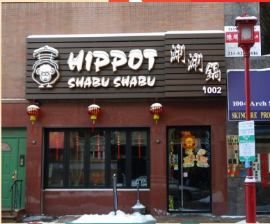
Hippot Shabu Shabu 1002 Arch St. Chinese hot pot

The next time you are in Chinatown, make sure to stop by these recently opened businesses. From crispy Korean fried chicken to spicy Chinese hot pot, there's something for everyone!