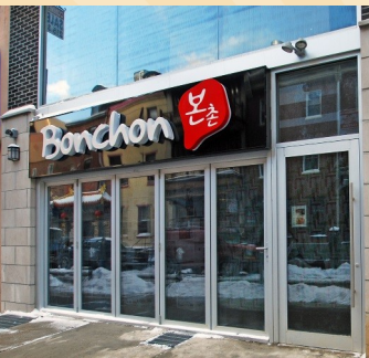
Bonchon 1020 Cherry St. Korean fried chicken