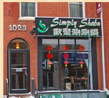
Simply Shabu 1023 Cherry St. Chinese hot pot