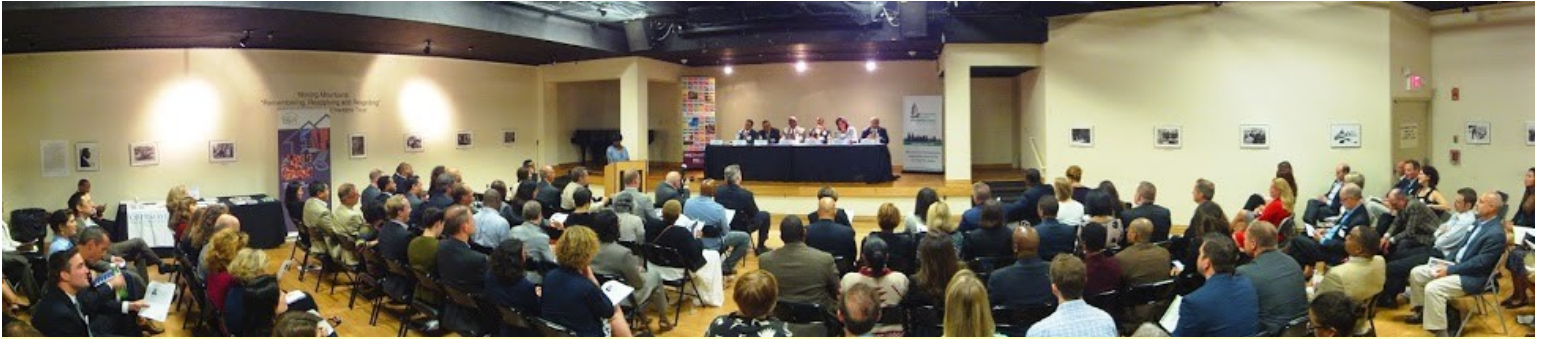
Forum at the African American Museum of Philadelphia