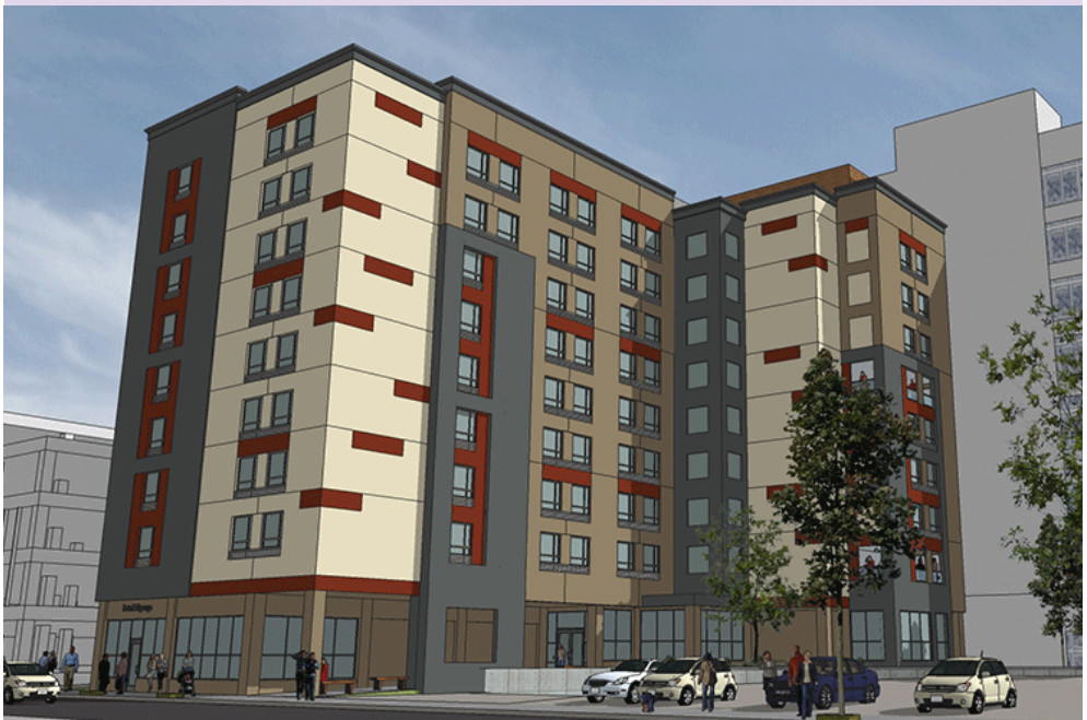
810 Arch Street , Ping An House Rendering by Kramer Marks Architects