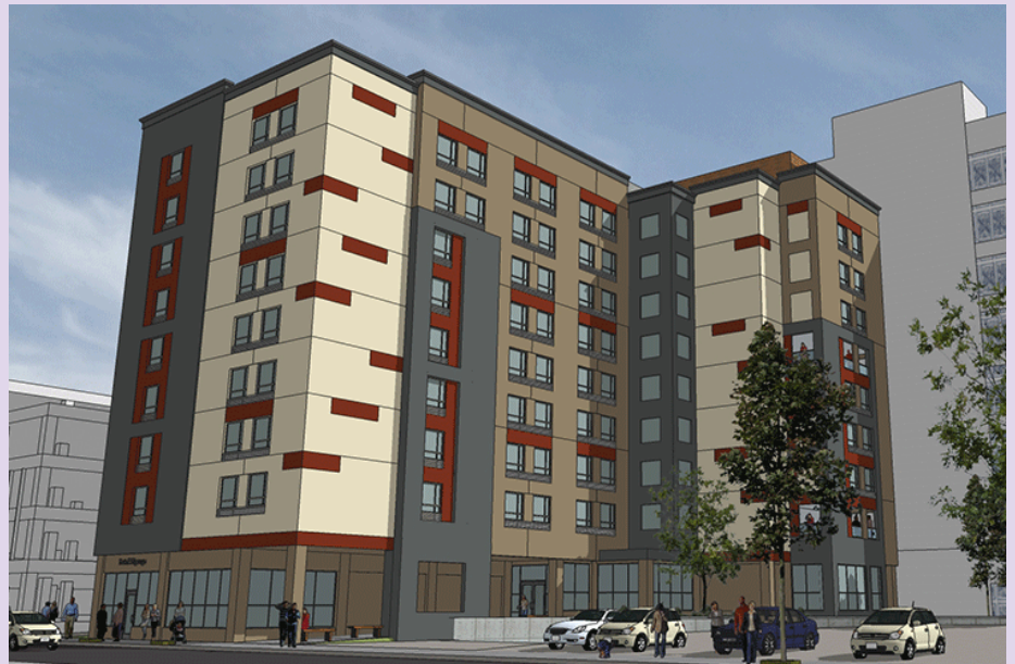
810 亞區街，由Kramer Marks建築繪製的平安樓模擬圖