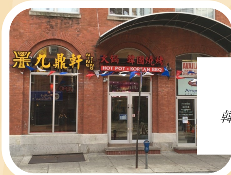
Nine Ting 禮士街926號 韓國燒烤 Korean Barbecue