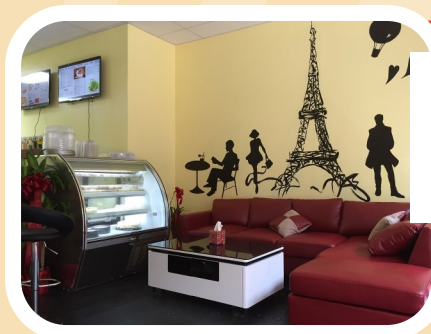
Miss Sweet 115 N. 9th Street Bubble Tea and Sweets