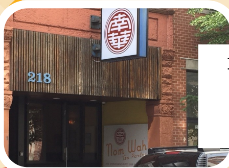
Nom Wah Tea Parlor 北13街218號 點心