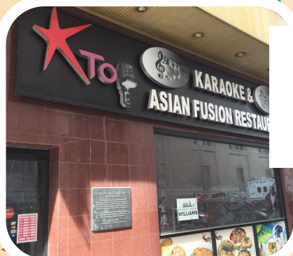
KTOP 9街和禮士街 卡拉OK和亞洲料理

在你下次來華埠的時候，記得光臨一下這些新開的商舖。從卡拉OK、點心、到韓國燒烤，每個人都可以找到自己想要的！