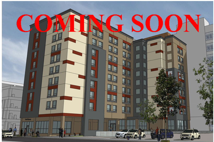
A rendering of Ping An House located at 810 Arch Street