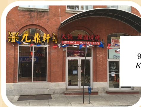
Nine Ting 926 Race Street Korean Barbecue