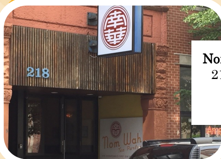
Nom Wah Tea Parlor 218 N. 13th Street Dim Sum