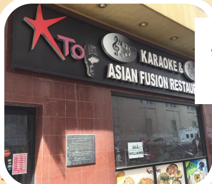
KTOP 9th and Race Street Karaoke and Asian Fusion Restaurant

The next time you are in Chinatown, make sure to stop by these recently opened businesses. From karaoke, to dim sum to Korean barbecue, there's something for everyone!